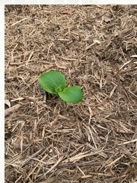
Biggest Pumpkin Competition