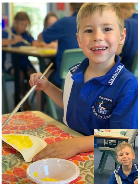
Kindergarten Transition Days